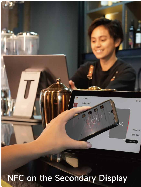
NFC on the Secondary Display